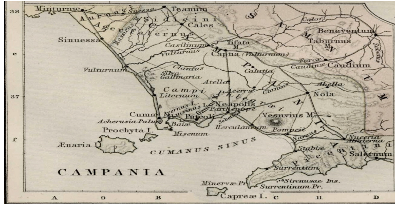
Figure 6: Ancient Campania 118

Also, the region of Campania was affected by more than one type of disaster during the Vesuvius event. Pliny (6.16) and Cassius Dio (66.22.3) mention earthquakes occurring for days prior to the volcanic blast. This means evidence for recovery should include restoration from earthquake damage and should not be limited to resurrection from either general ashfall or the ashes of the pyroclastic flows.