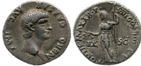
Figure 5: Silver denarius dating to 61-62 CE depicting Nero on the obverse and Ceres on the reverse. 61

grain. 59 Thus, observing the rituals of these gods was to protect the city's future by appeasing the gods of fire and grain. 60